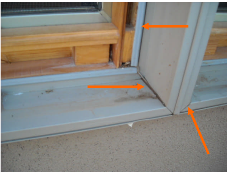
Suspect interior seal gaps as well and leaks in metal cladding at seams; there were gaps (seal failure)